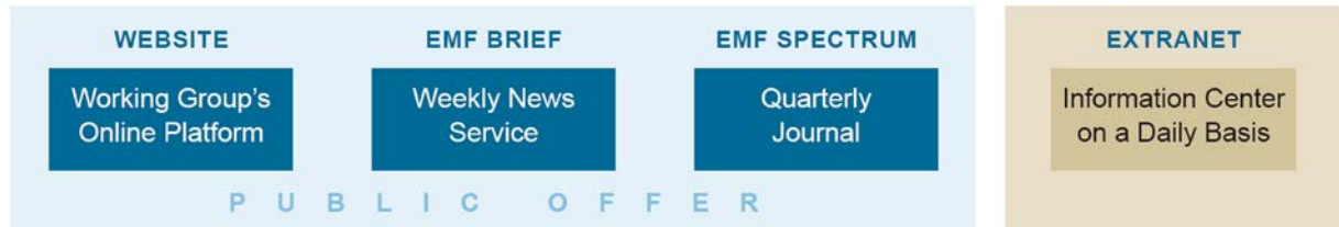
Figure 2: Public and non-public information offer of the working group

extended permanently. Clients can find and download here from the thematically structured content: papers, comments, media articles, pictures, graphics, presentations, links to documents, and more. Extensive networking activities and the organization of workshops have been tackled also. So the group meanwhile serves as a known reliable and independent point of contact for EMF information. It positions itself complementary to already existing EMF information sources.